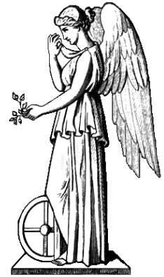
God's word says He gives His angels charge over us.