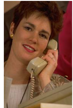
We must watch the words of our mouth , even when on the phone.

We must always speak words of faith and encouragement to others if we expect the same to come back to us. If we knew for sure what we spoke would always come to pass then we would really watch what we speak. Well, guess what? They do come to pass! Let this be our prayer-Psalm 19:14: “Let the words of my mouth and the meditation of my heart be acceptable in thy sight, O Lord, My strength and my redeemer.