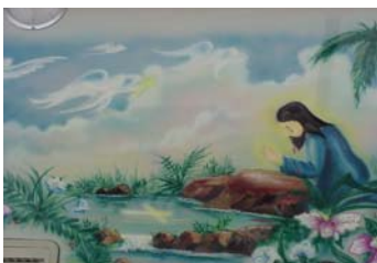
A mural done by Hutch at Lakewood Campground, Myrtle Beach, S.C. , showing Jesus praying in the garden.

we want more blessings and want the Lord to shield us from evil then we must walk in the joy of the Lord. That is what the Word means about it is our strength. Without strength, we are weak and open for anything that comes along, but with God's joy upon us, His shield of protection is upon us also.