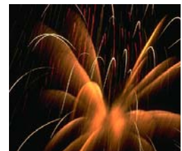
Joy is like a spontaneous combustion. It should go off when we encounter negative things contrary to what God's Word says.

Just stand back, trust the Lord and His Word and watch God move in your behalf.