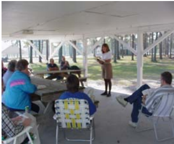
Here, I was ministering on the Joy of the Lord at a campground near Aurora, N.C. It was a special time of fellowship and giving thanks to the Lord.

The joy of the Lord acts as a shield against the enemy when we are walking, talking, and living in joy. You can be so tired and weary from a long day, but if you will put on some praise music and begin to sing and maybe tap your foot, you will forget all about how tired you are. The old devil tries to drop hints into our minds all the time about how exhausted we are and how we just can't do another thing,